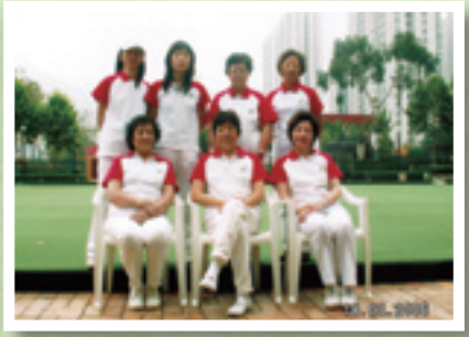
Champions -2005 Ladies Premier League Div.5