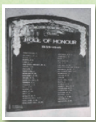
Roll of Honour

A remarkable, but at the same time fascinating evolution. During World War II and the occupation of Hong Kong the clubhouse was used for accommodation to house Japanese Officers and the Bowling Greens were dug up to produce agricultural crops to feed them.