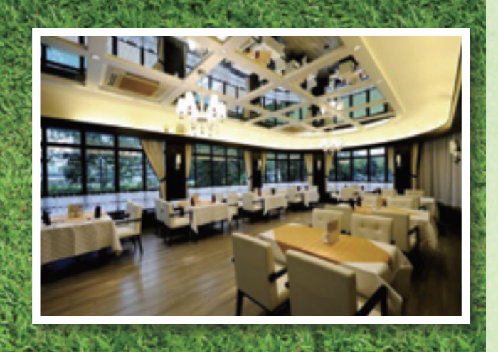
The Original Clubhouse 1900