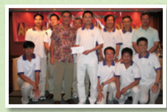
Champion of 2006 HKLBA Winter League Triple (Division 6)