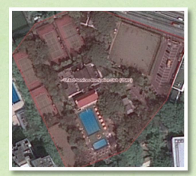
USRC - aerial view