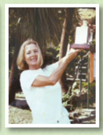
L King - Ladies National Champion of Champions, 1982, 1983