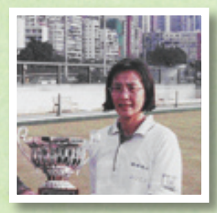
Mixed Singles Champion, 2001