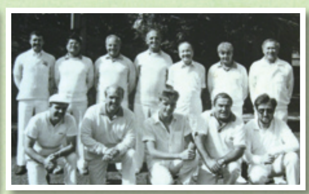
Winter League Champions (Men) 1984, 1986, 1987

In the late 90's and onwards, under an increase of interest in lawnbowling generally in Hong Kong, the Lawn Bowls Section has been experiencing a notable growth in membership: bowlers are now numbered close to 100 and are predominantly Chinese. Successful as in the past, the Section continues to enjoy a record of impressive results in league matches and open